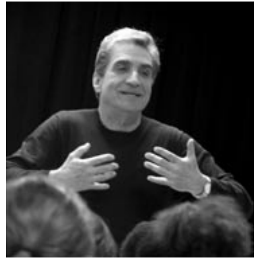
2007 Apollo Awardee Robert Pinsky with students at BAA.