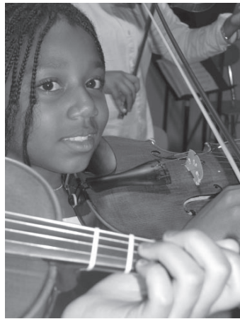
A young violinist from the Boston Academy Strings Program.

Thanks to our partner schools: the McCormack School, the Dever School and the Murphy School who recognize the value of the arts and continue to support this program. There will be a culminating performance on June 11 at the Roland Hayes School of Music. Look for details in our May newsletter.