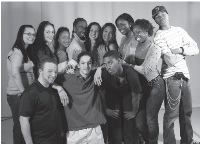
The class of 2008 BAA Dance Majors.

We thank the Massachusetts College of Art & Design for hosting our Senior Dance Concert this year.