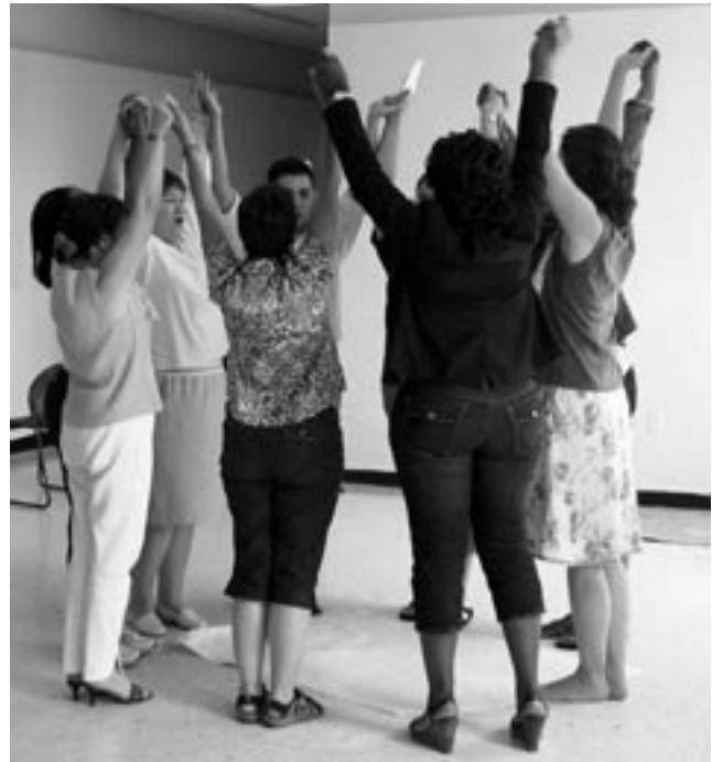
Educators participating in Summer Institute, July 2007.

The Summer Institute is designed to do two things: To convince educators that to increase achievement they must improve the way they address their students, and to serve as a resource for the change that is needed. School reform is difficult work. Everybody has an opinion and a vision of how it should look and feel. We try to show our participants not just how school reform looks but why it works, the theoretical basis of our work. The Summer Institute helps educators become agents of transformation. In the end, we hope that our work will enrich not only the student but also the teachers as they pursue their life's work.